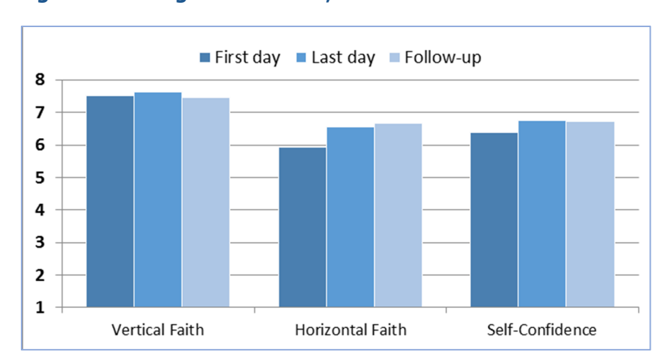
Figure 3: Average of 3 Factors, Measured Over Time

Figure 3 shows the average values of the indices for the campers that completed all three surveys. Vertical faith showed significant growth from the first day of camp to the last day (p < .001) followed by significant decline to near pre-camp levels by the follow-up survey (p < .01). Both horizontal faith and self-confidence also showed significant growth from the first to the last day of camp (in both cases, p < .001) but showed no significant change from the last day of camp to the follow-up survey, indicating that the growth was maintained.