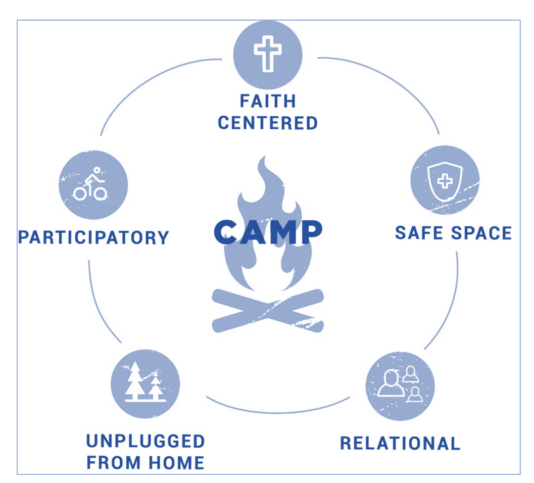
Figure 1. Five Fundamental Characteristics of Christian Camp

a breakdown in one or more characteristics of the proposed Christian camp model (see Figure 1). Each of these characteristics in the model is briefly described here.