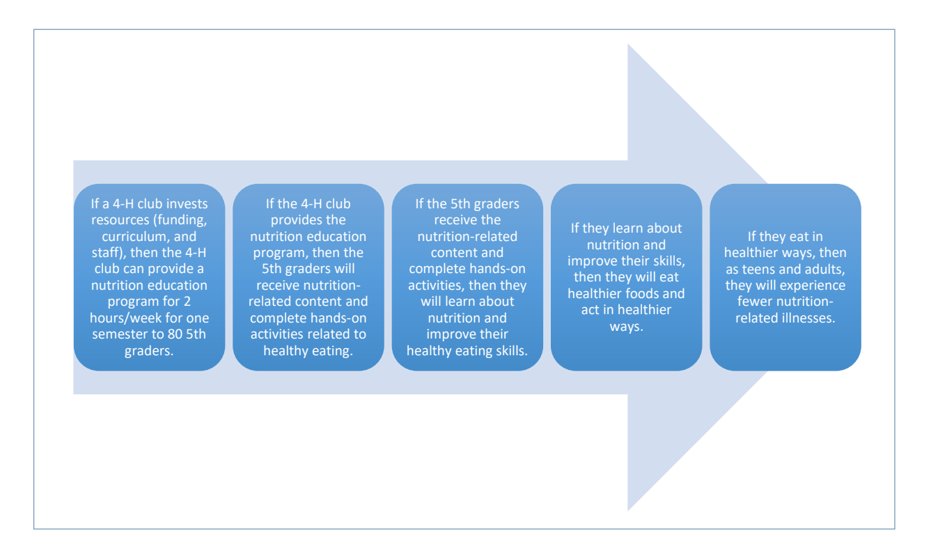
Figure 2. Example of Developing a Theory of Change through a Series of If-Then Relationships

The second leading weakness was related to program evaluation. As mentioned earlier, programs that were not identified as being ready for replication or more intensive outcome evaluation often used a posttest only or focused exclusively on process or implementation evaluation. At least a pretest/posttest design that collects data from participants before and after a program is needed to estimate the program's effect by comparing data from these two measurement points (Rossi, Lipsey, & Freeman, 2004). Additionally, while process or implementation evaluation are important for helping identify reasons that a program failed to achieve its objectives, it does not provide evidence that the desired outcomes were met. Ideally, thorough evaluation would include both process or implementation evaluation and outcome evaluation using at least a pretest/posttest design.